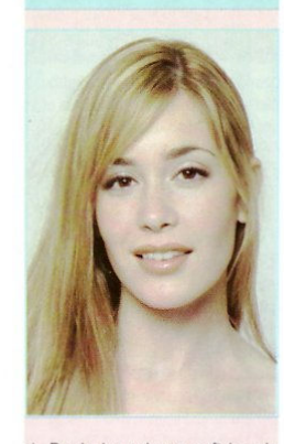
Begin by using a soft boar's head brush or similar natural bristle brush to make sure that all knots are completely removed from all strands. Smooth all of the hair with a hot flat iron, allowing hair to cool completely before proceeding.