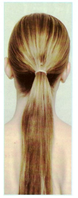
3. Secure the ponytail tightly with a "hair friendly" elastic band. The gathered base of the ponytail should rest approximately six to eight inches up from the base of the head. Brush the new ponytail to smooth.

Depending on the number and the size of the buckled curls to be created, separate the ponytail into one-inch thick strands.