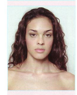
Begin by using a soft boar's head brush or similar natural bristle brush to make sure that all knots are completely removed.