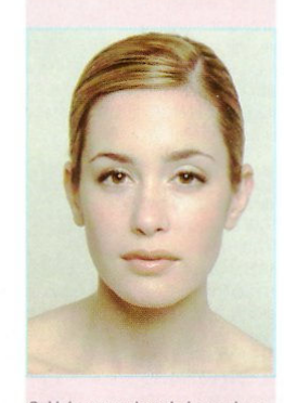
2. Using your hands in conjunction with the brush, gather all of the hair into a tight ponytail with a low base that rests near the nape of the neck. Make sure that all of the hair is brushed smoothly and tightly behind the ears and back from the hairline. The key is a very sleek crown area.