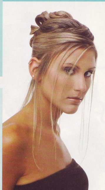
Technicolor Salon & Spa. Bethlehem, PA